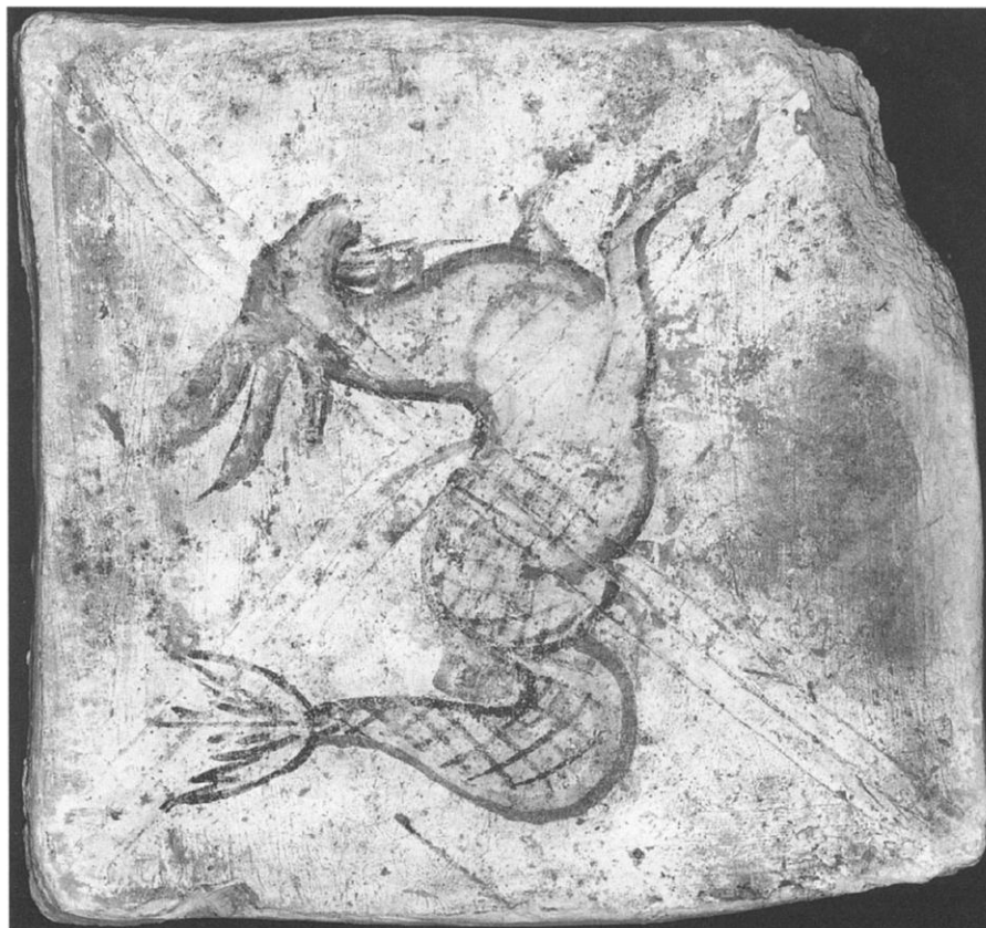
1. PAINTED TERRACOTTA CEILING TILE FROM THE DURA EUROPOS SYNAGOGUE, MID-THIRD CENTURY A.D. NOW IN THE YALE UNIVERSITY ART GALLERY.