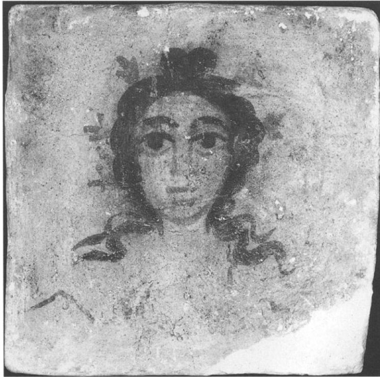
1. PAINTED TERRACOTTA CEILING TILE FROM THE DURA EUROPOS SYNAGOGUE, MID-THIRD CENTURY A.D. NOW IN THE YALE UNIVERSITY ART GALLERY.