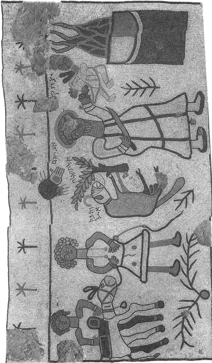
PANEL DEPICTING THE SACRIFICE OF ISAAC FROM THE MOSAIC PAVEMENT OF THE BETH ALPHA SYNAGOGUE, PALESTINE, DISCOVERED IN 1929. PROBABLY SIXTH CENTURY A.D. TO THE LEFT ARE TWO YOUTHS WITH A SADDLED DONKEY THAT HAS A BELL AROUND ITS NECK. IN THE CENTRE IS A RAM BOUND TO A TREE WITH THE HAND OF GOD ABOVE. THE HEBREW INSCRIPTIONS READ 'AND BEHOLD A RAM' ABOVE THE RAM, AND 'LAY NOT [THINE HAND UPON THE LAD]' ABOVE THE TREE. BOTH ABRAHAM AND THE CHILD ISAAC, TO THE RIGHT BESIDE A FLAMING ALTAR, ARE NAMED IN HEBREW.