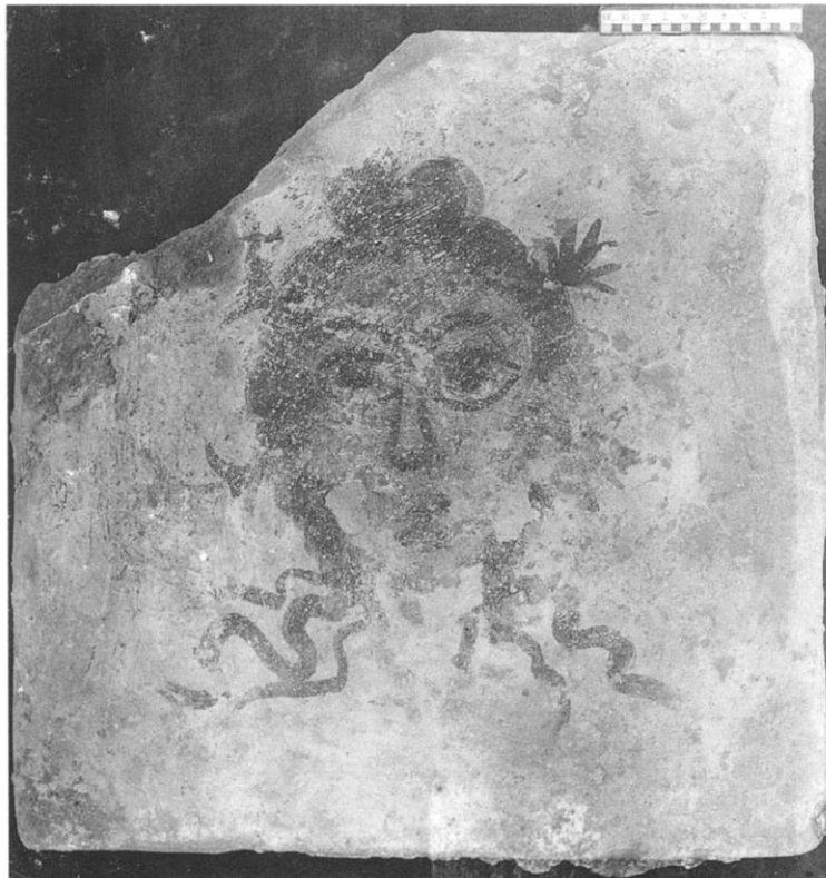
2. PAINTED TERRACOTTA CEILING TILE FROM THE HOUSE OF THE LARGE ATRIUM AT DURA EUROPOS (ALSO KNOWN AS THE HOUSE OF THE COURT), MID-THIRD CENTURY A.D. NOW IN THE YALE UNIVERSITY ART GALLERY.