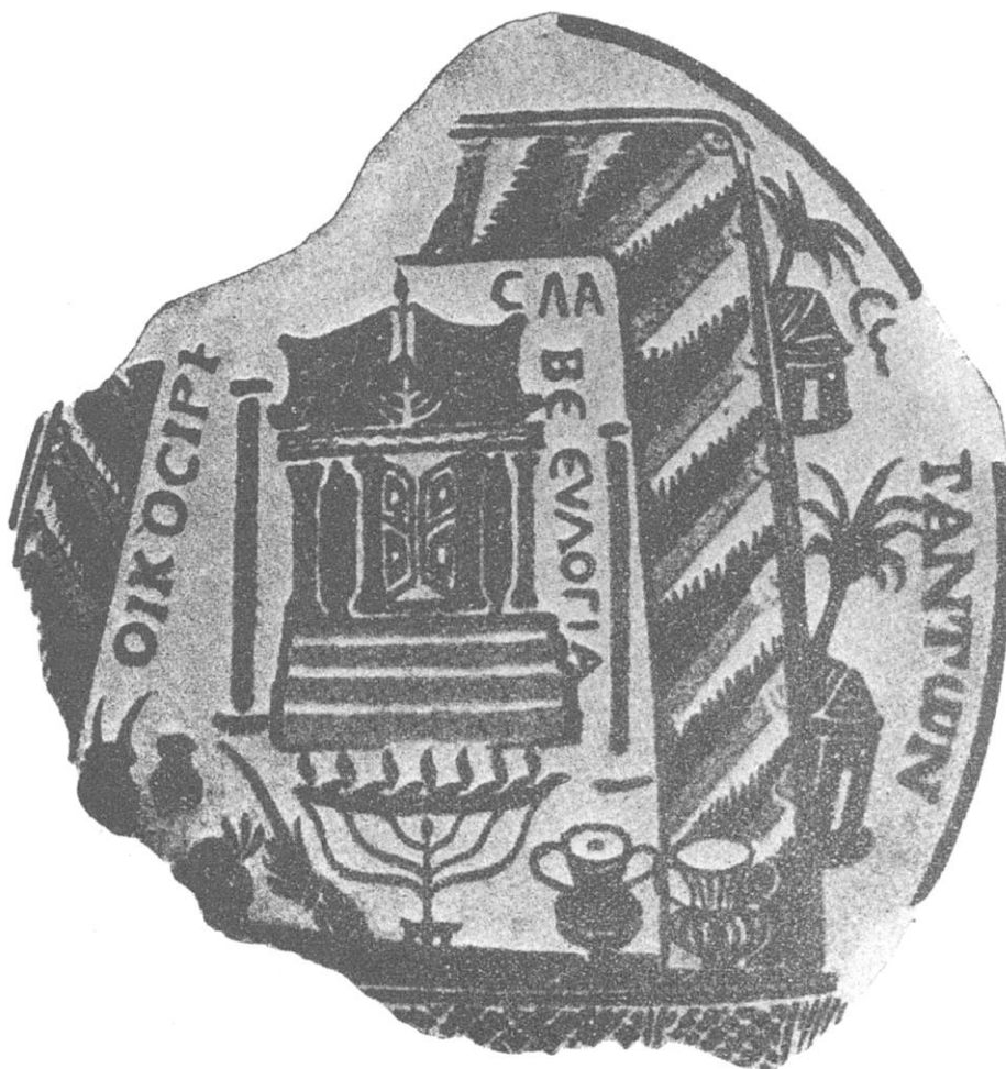
FIG. 1. FRAGMENTARY GOLD GLASS DISK FROM THE CATACOMB OF MARCELLINUS AND PETER, ROME. REMOVED, WITHOUT MORE PRECISE INFORMATION OF PROVENANCE, IN THE NINETEENTH CENTURY AND NOW IN THE VATICAN MUSEUMS. PROBABLY FOURTH CENTURY A.D. THE ICONOGRAPHY IS SOMEWHAT CONTROVERSIAL, SHOWING A FLAMING MENORAH BEFORE EITHER A TOMB OR A SHRINE FLANKED BY FREE-STANDING COLUMNS IN AN ENCLOSED COMPOUND WITH VASES AND OTHER RITUAL(?) PARAPHERNALIA. OUTSIDE THE COMPOUND TO THE RIGHT ARE SMALL AEDICULAE AND PALM TREES. After the diagram in Goodenough (1953), vol. 3, no. 978.

outside the perimeter wall. Not the least interesting part of the object is its inscription, which reads: