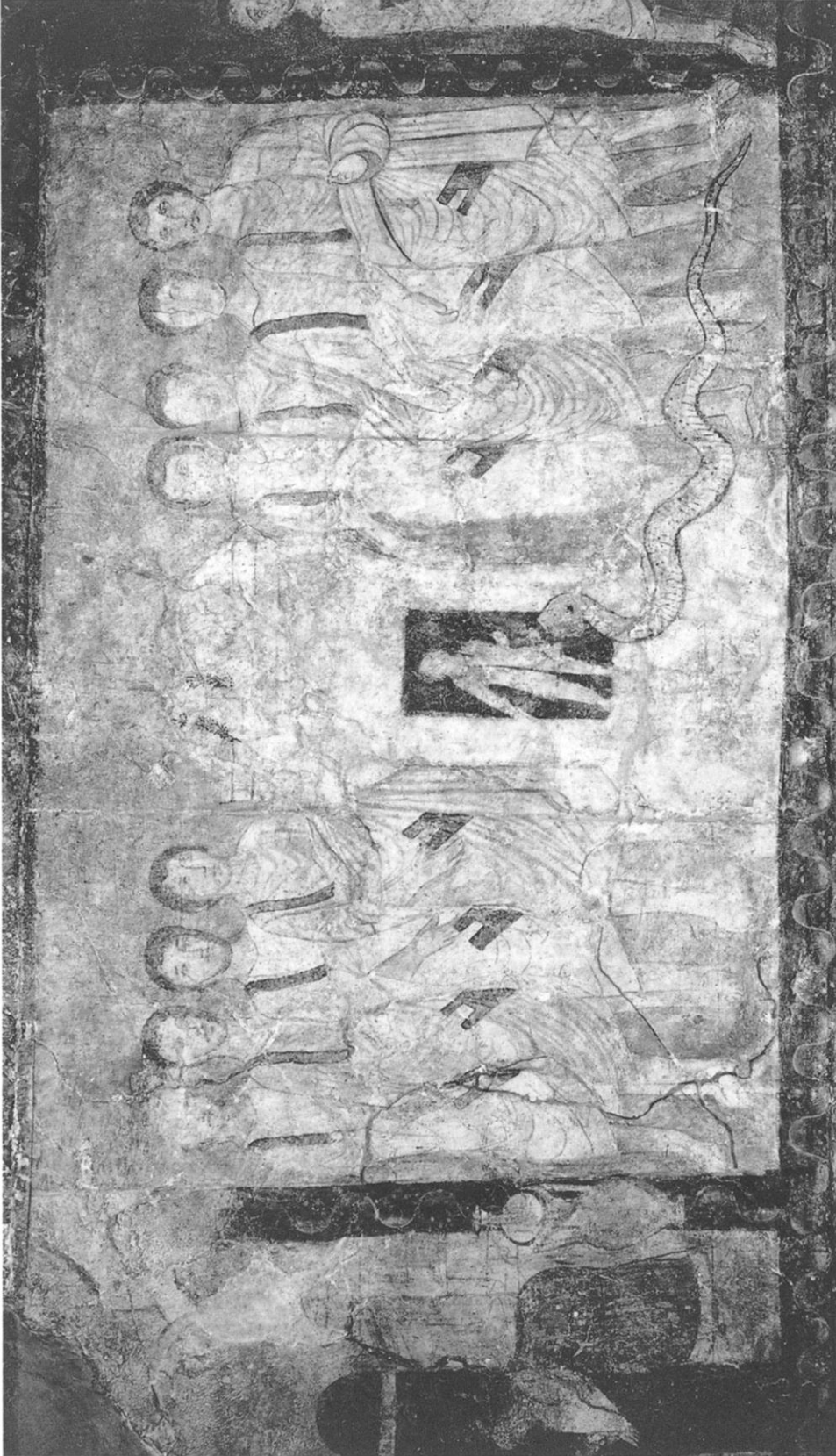
FRESCO OF THE PROPHETS OF BAAL MAKING SACRIFICE ON MOUNT CARMEL, FROM THE LOWER TIER OF THE SOUTH WALL OF THE DURA EUROPOS SYNAGOGUE. NOW IN THE DAMASCUS MUSEUM. C. A.D. 240. THE PRIESTS OF BAAL, STANDING IN GROUPS OF FOUR TO EITHER SIDE OF THE ALTAR IN THE CENTRE, FAIL TO SUMMON FIRE FROM HEAVEN TO CONSUME THE CARLANDED BULLOCK ON THE ALTAR. IN THE NICHE BELOW THE ALTAR IS HIEL, WHO — ACCORDING TO JEWISH LEGEND — TRIED TO IGNITE THE WOOD MANUALLY WHEN BAAL FAILED TO INTERVENE SUPERNATURALLY, BUT WAS KILLED BY A SERPENT SENT BY GOD.