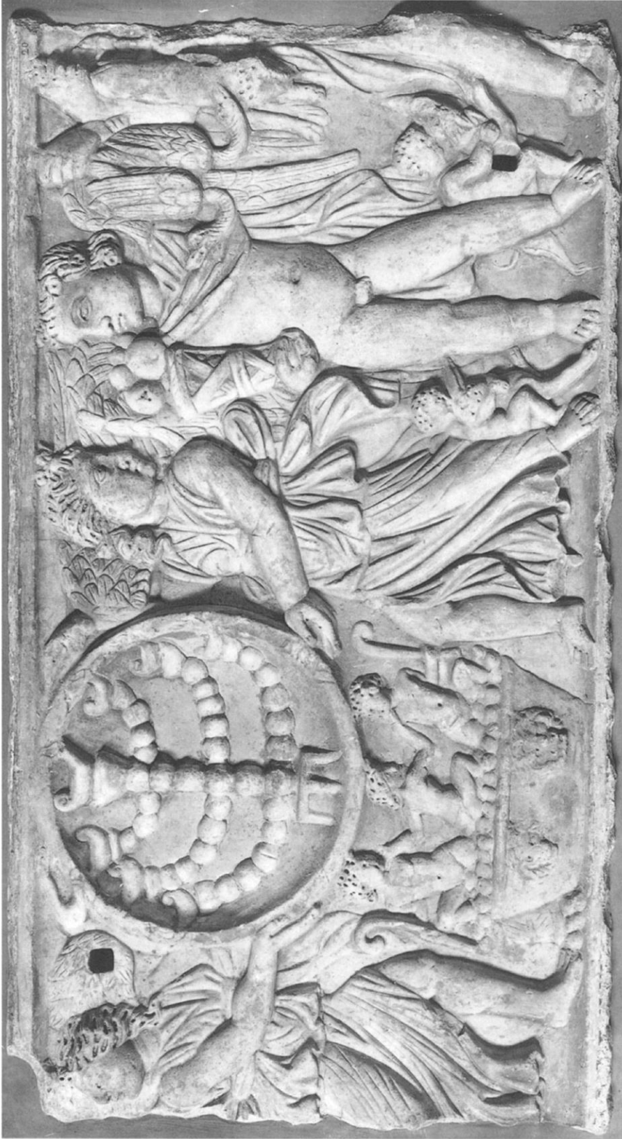
FRAGMENT OF A SEASONS SARCOPHAGUS FROM ROME (EXACT PROVENANCE UNKNOWN THOUGH OFTEN MISREPORTED AS FROM THE VIGNA RANDANINI CATAOMB, WHICH HAS JEWISH ICONOGRAPHY), NOW IN THE MUSEO NAZIONALE ROMANO. PROBABLY LAST QUARTER OF THE THIRD CENTURY A.D. THE CLIPEUS HELD BY THE TWO CENTRAL WINGED VICTORIES (WHICH WOULD HAVE ORIGINALLY BEEN FLANKED BY THE FOUR SEASONS IN THE GUISE OF WINGED EROTES, OF WHOM ONLY AUTUMN CARRYING A BASKET OF FRUITS IS INTACT) WOULD NORMALLY HAVE HELD A PORTRAIT TONDO OF THE DECEASED, BUT HAS HERE BEEN CUT (OR RECUT?) TO DEPICT A MENORAH. BENEATH THE MENORAH ARE THREE PUTTI TREADING GRAPES IN A BASIN, A COMMON MOTIF WITH POSSIBLE BUT NOT EXCLUSIVELY DIONYSIAC INTIMATIONS, AS WELL AS OTHER PUTTI RIDING ANIMALS BY THE FEET OF THE VICTORIES AND SEASONS.